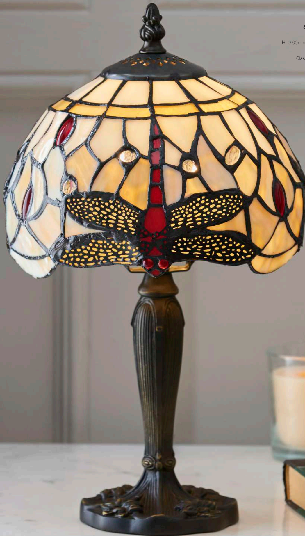
8. Mini table 64087 H: 360mm Dia: 200mm 1 x E14 Class 2, Inline switch