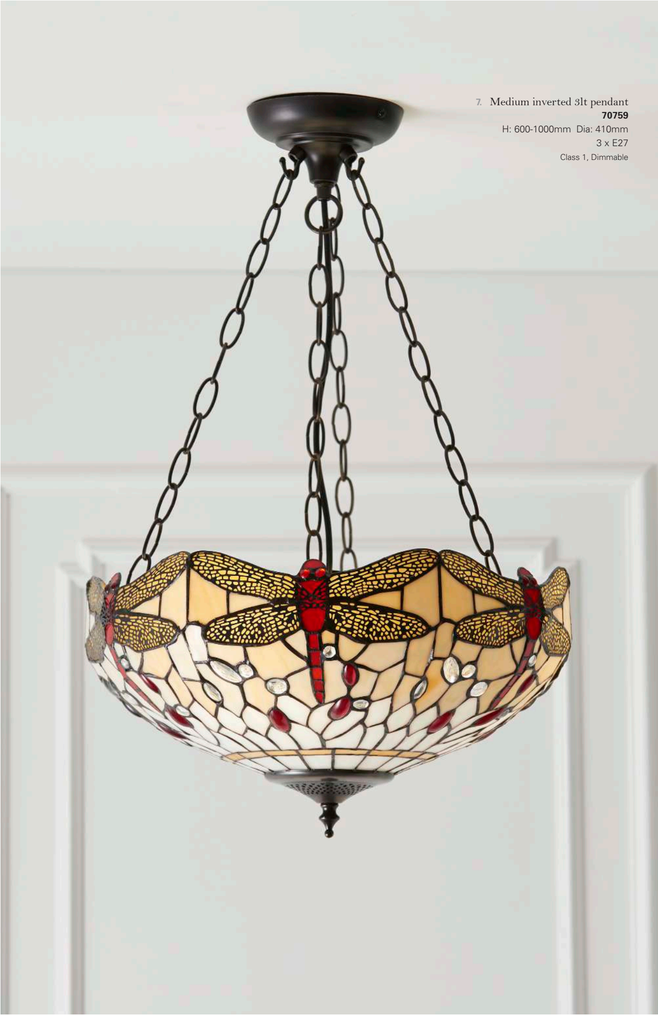
7. Medium inverted 3lt pendant 70759 H: 600-1000mm Dia: 410mm 3 x E27 Class 1, Dimmable